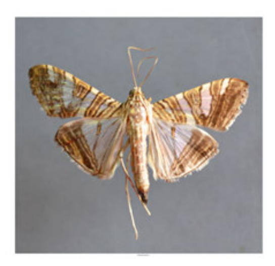
3f. G. stolalis