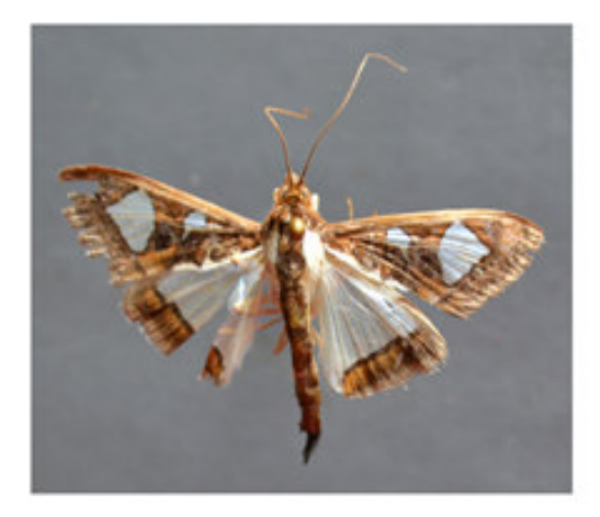
3a. G. bivitralis