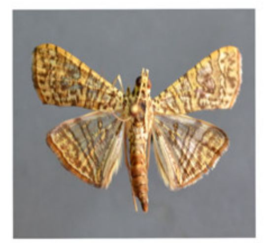
3e. G. pulverulentalis