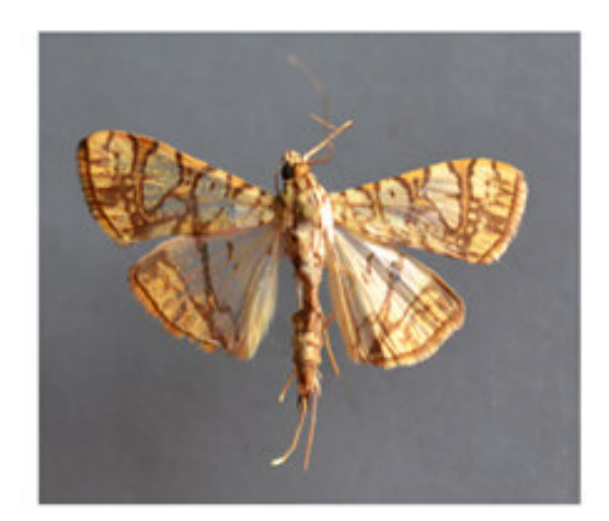
3b. G. caesalis