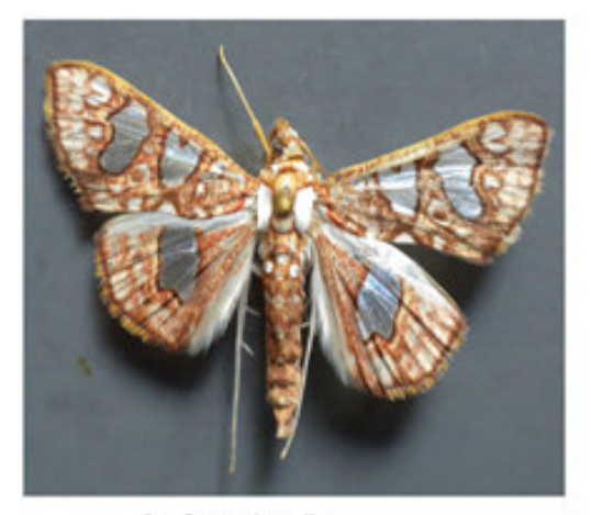
3c. G. canthusalis