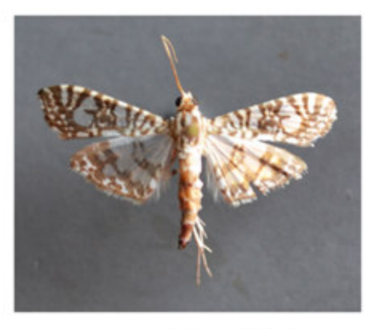
3d. G. onychinalis