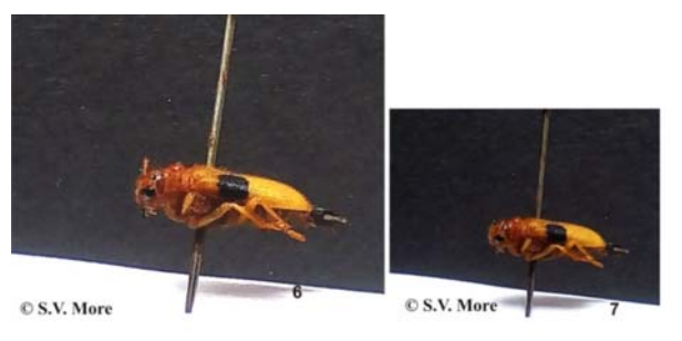
Fig. 6 & 7. Astathes bimaculata (lateral view)

It is small sized insect with yellowish and orange colored body. Antennae somewhat fuscous and covered with black and golden pubescence with a little shorter than the body and they are not reaching