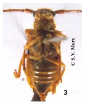
Fig. 3. Astathes bimaculata (ventral view)