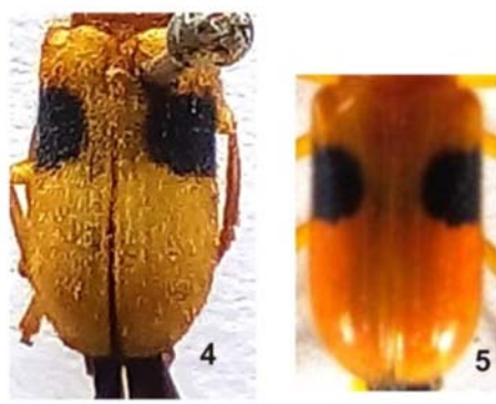
Fig. 4 & 5. Astathes bimaculata (elytra)