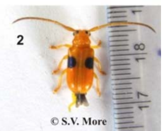
Fig.1 & 2. Astathes bimaculata (dorsal view)