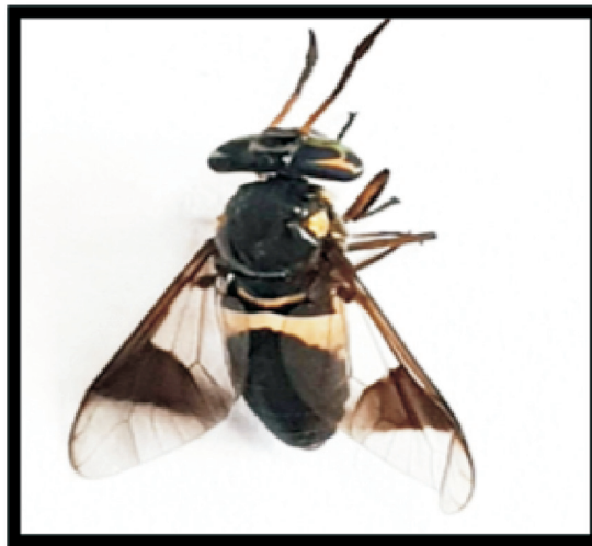
Fig. 2. DeerFly ( Chrysops flavocinctus ).

secondary skin infection were also observed due to severe itching (Fig. 1). Field observations revealed that at least ten villages situated in both sides of a stretch of a dead river were mainly affected. Among these ten villages, five villages were affected more due to their close proximity to the water body.