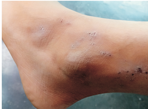
Fig. 1. Skin infection caused due to biting of fly species.