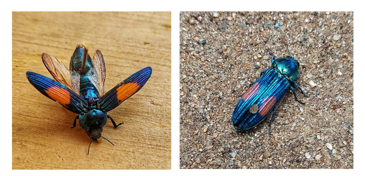
Fig. 1 Strigoptera bimaculata (Linnaeus., 1758) (Coleoptera: Buprestidae) found from, Madurai, Tamil Nadu, India