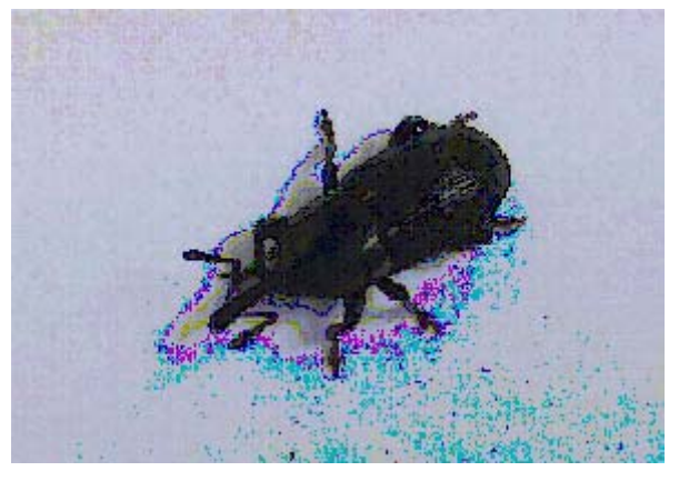
Fig.1 a. Athesapeuta cyperi Marshall

© 2016 Association for Advancement of Entomology