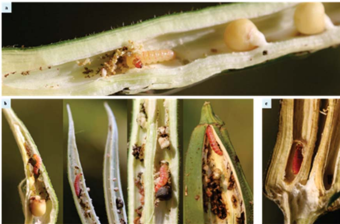
Plate 1: Natural incidence of pectinophora gossypiella (Saunders) on okra a) Early instar larva inside the fruit, b) Grown-up larvae feeding on seeds, c. Pupa in the damaged fruit