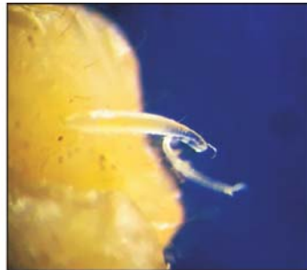
Eggs laid on WSB larva