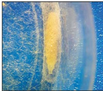
Parasitoid - Pupa