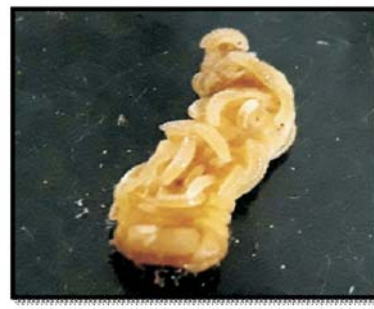
Parasitized larva of WSB

slit and covered with cotton plug. Oviposition was observed in the larva present inside the muslin cloth. Long and slender eggs were laid in groups and hatched larvae were found to feed externally on the WSB larva. The female parasitoid was larger in size (1 to 1.3 cm) compared to male (0.3 to 0.4 cm). The life cycle of the parasitoid was studied on WSB larvae using the slide technique. The development period of egg, larvae and pupa were recorded as 6.14 \pm 0.89 (5-7), 11.14 \pm 1.86 (9-14) and 27.14 \pm 3.6 (24-31) days, respectively. The study revealed that the time taken for completion of the life cycle ranged from 38 to 44 days.