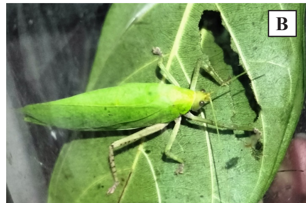
Plate 1 A. Adult female, B. Adult male